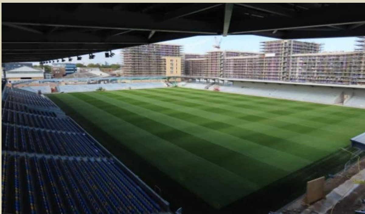
Copperside and Railway End

Take the M25 to junction 10 then take the A3 for Guuiford and at the roundabout take the first exit on to the A3 from the West and third exit from the east and continue to Raynes Park then take the A298 for Wimbledon.