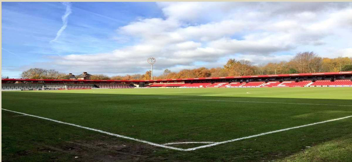
North Stand and West Terrace

At the back of the stand, there is quite a tall retaining 'wall' between the seating area and the roof. The team dugouts are located at the front of this stand. Although this stand on the Neville Road Stand replaced the old Main Stand, it is the new Moor Lane Stand opposite that has more facilities, with glassed corporate areas at the rear of it. It too is all-seated and is of a similar height to the Neville Road Stand. Both ends have new covered terraces, with the West Terrace, being the first of the new stands to be constructed of the new stadium.