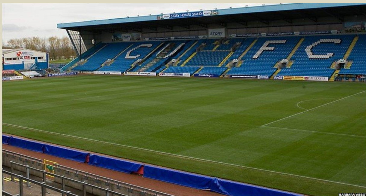
East Stand (Babs Arnott)

The Story Homes (East) Stand on one side of the pitch, is a covered all seated stand, and this stand was opened in 1996. The other side is an old partly covered (to the rear) Main Stand, which has seating at the back and a terraced paddock to the front. The central part of this stand was built in 1954 and the wings added at a later stage.