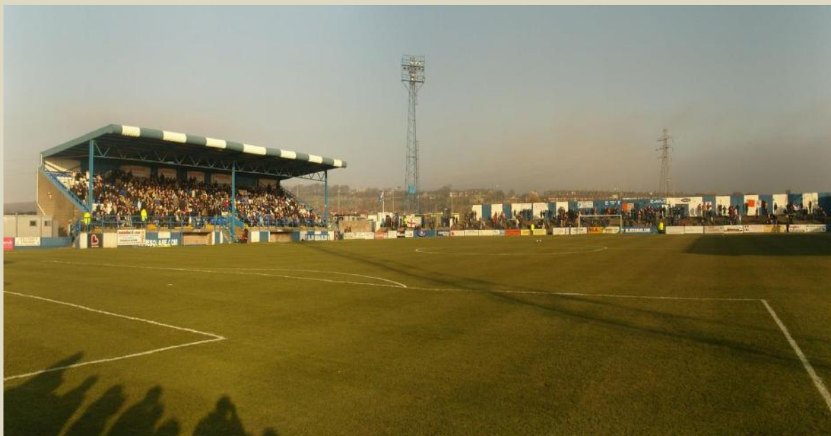
The Main Stand & Holker Street End (The Square Ball)

Kit Manufacturer: Joma Website: www.barrowafc.co.uk Programme: £2