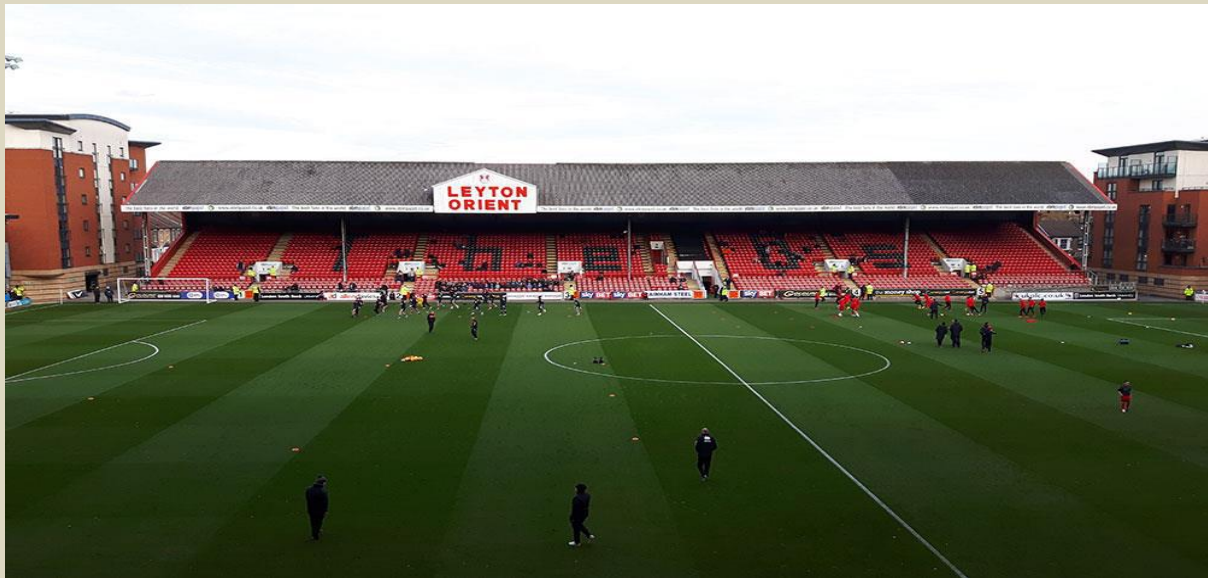
The East Stand

At the North End is the ground is the most recent addition to the stadium. The North Stand was opened at the beginning of the 2007/08 season and replaced a former open terrace. This simple looking covered all seated stand, has space for 1,351 spectators and is near identical to the Tommy Johnston Stand.