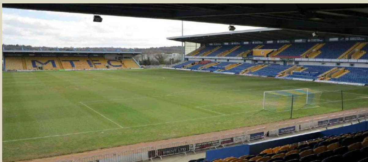
The West Stand (Ian Greaves) & Quarry Lane

The ground was first played on by the local cricket club which was a large piece of land between today's Sibworth Street and Portland and encompasses today the plastic pitches the main stand and the whole of the ground where The Ian Greaves Stand currently the largest stand made up of an upper and lower tier, and executive seating.