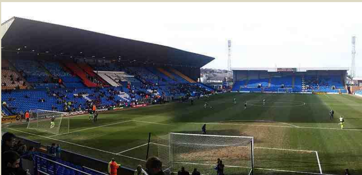
The Main Stand & cowshed from the Kop

The Bebington Kop, simply referred to as the Kop, is a large single-tier, all-seater stand with a capacity of 5,696 it was completed in 1995, and it replaced the earlier open terrace (also called the Kop) which had stood behind the goal at the Bebington End. Originally the Kop housed both home and away fans, split down the middle, and occasionally was handed entirely to the away fans. However, following the 2000 League Cup semi-final against Bolton Wanderers, when the Kop was given entirely to the home fans, a campaign was begun to claim the Kop as a home end. From 2000-01 this became the case, with away fans housed in the Cowshed.