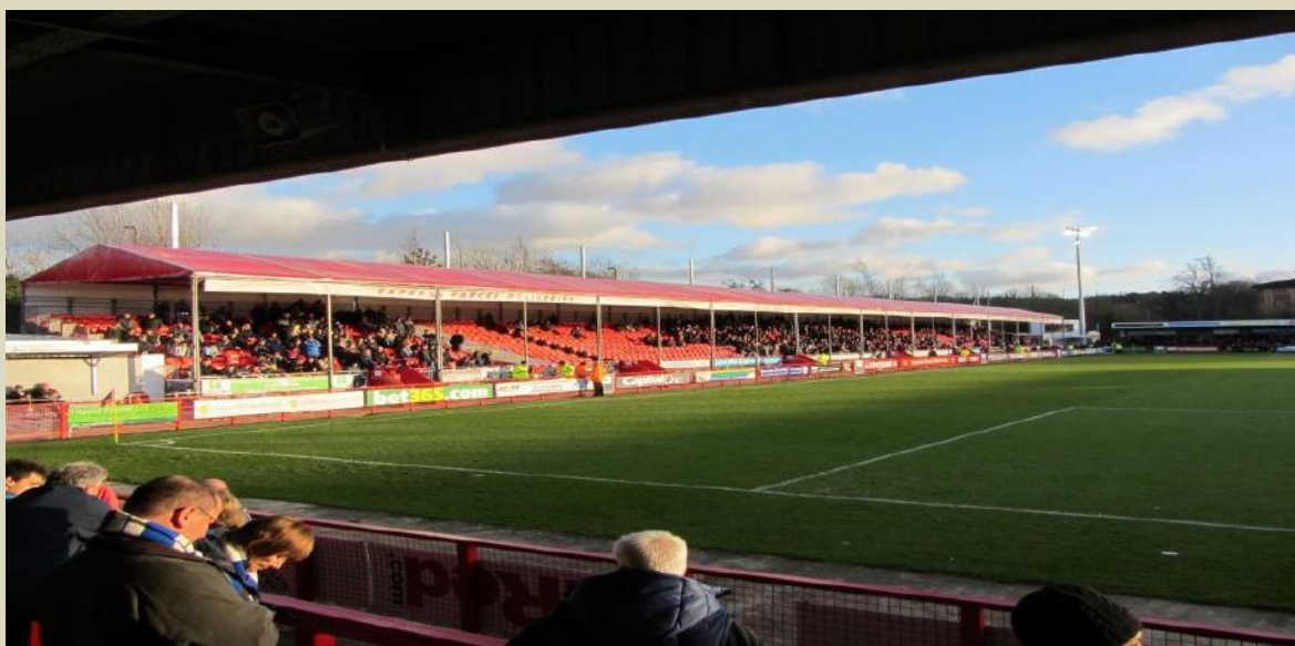
The East Stand

Opposite is the new East Stand which was opened in April 2012. This semi-permanent all seated stand, accommodates 2,145 spectators in 12 rows of seating. The stand does though have a fair few supporting pillars running across the front of it that could impede your view. A pair of new floodlight pylons has also been erected to either side of the stand adding the lighting pylons on the West Stand.