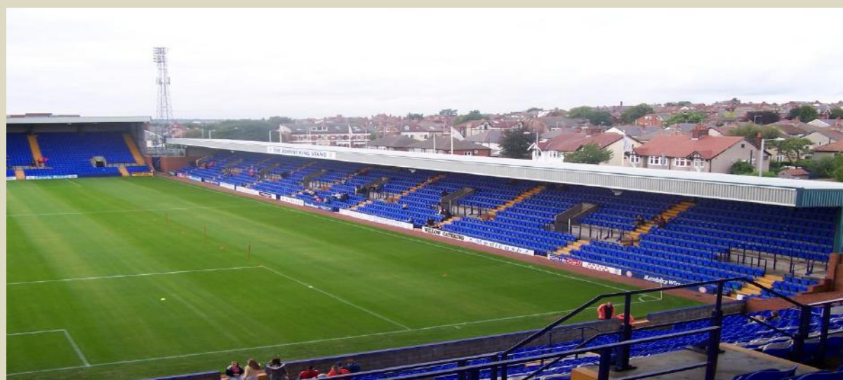
John King Stand

For away fans to drink there is The Prenton Park Hotel Just a few yards from the ground crowded on match days but good selection of beers and food and not far from the turnstiles. If that is too busy then try the Fazone or the birch Pub or Sportsman both on Prenton Road