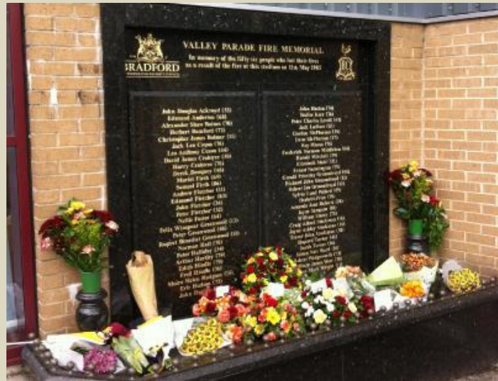
A memorial, erected on the club's new main stand at Valley Parade, to the 56 killed in the fire of 1985

The Midland Road (Betrescue) Stand is a covered single tiered stand, which has windshields to each side. At the remaining end is the TL Dallas stand which is a small 'Double Decker' type stand. This two tiered covered stand has the upper tier largely overhanging the lower tier, giving this 'double Decker' effect. There is also a large electric scoreboard in one corner of the ground, between the Midland Road and TL Dallas Stands.