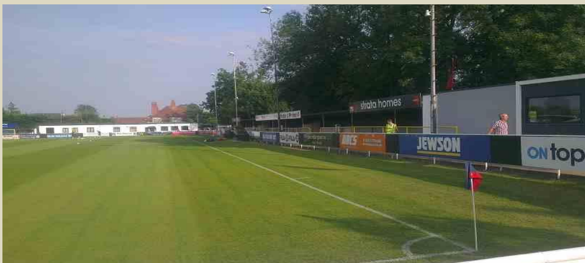
Wetherby and Clubhouse Ends