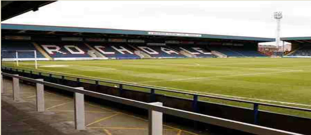
Willbutts Lane Stand

This has a number of supporting pillars and some executive boxes at the back. Away supporters are housed on one side of the Willbutts Lane Stand, where around 1,500 fans can be housed. If demand requires it, then the whole of this stand can be given to visiting fans increasing the allocation to 3,700. The stand is normally shared with home supporters with away fans being seated towards the Sandy Lane End.