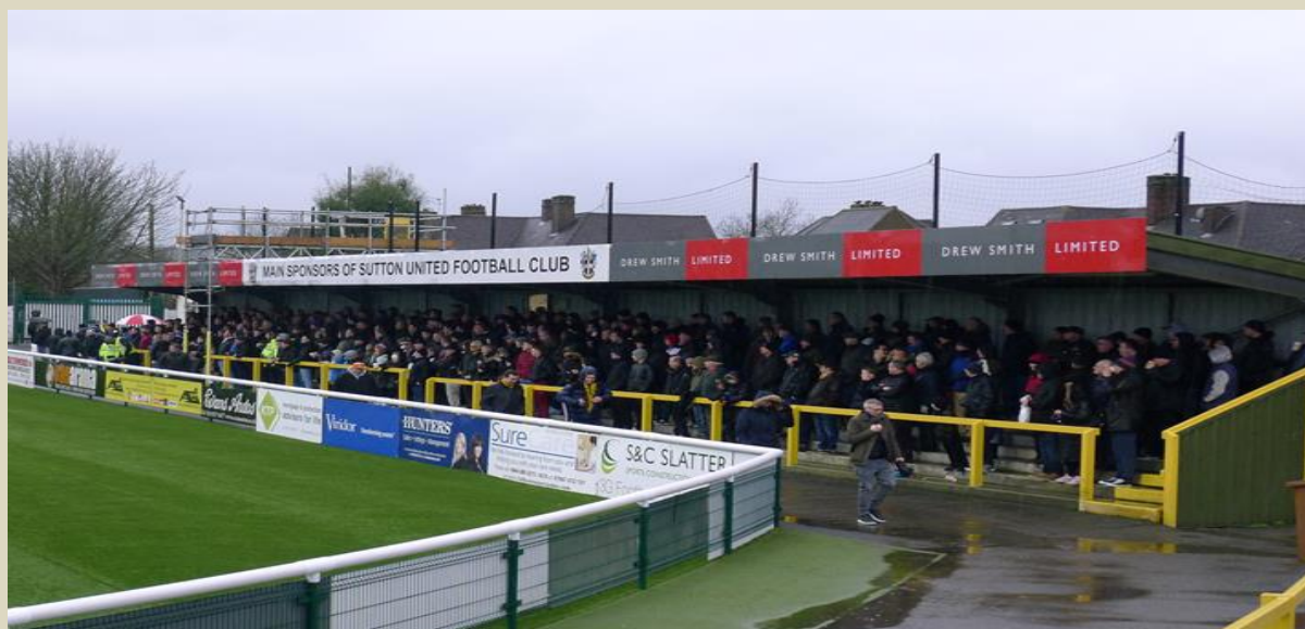
Gander Green End