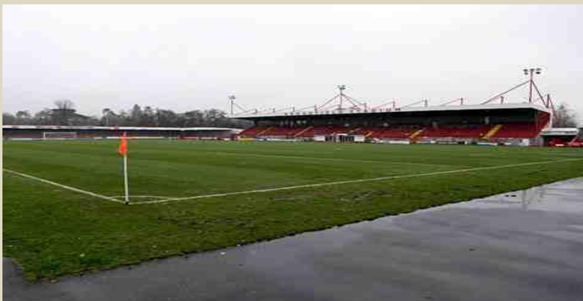
The Main Stand and North Stand

Opposite is the new East Stand which was opened in April 2012. This semi-permanent all seated stand, accommodates 2,145 spectators in 12 rows of seating. The stand does though have a fair few supporting pillars running across the front of it that could impede your view. A pair of new floodlight pylons has also been erected to either side of the stand adding the lighting pylons on the West Stand.