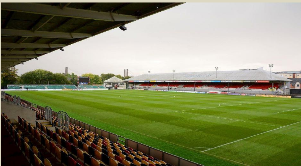
Hazell Stand & South end

The South End is largely unused for spectators for football. In the corner is another building with a large pyramid shaped roof. This houses the dressing rooms and the teams come onto the pitch from this corner of the ground. There is an electric scoreboard mounted on the front of this building.