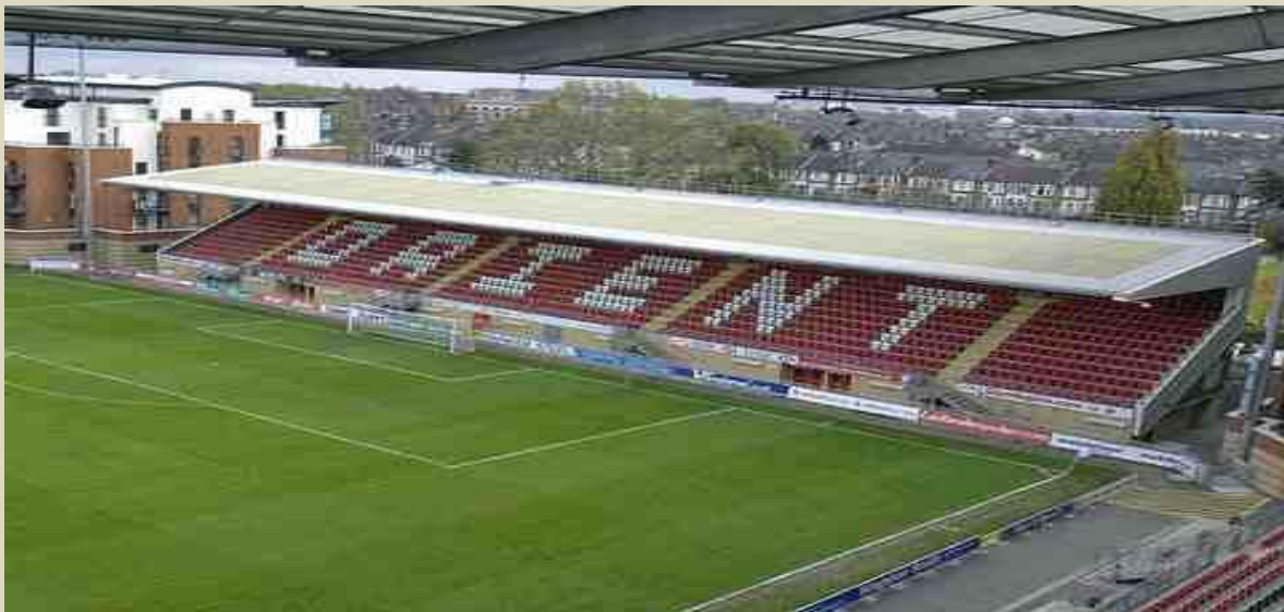
Tommy Johnston (South Stand)

Opposite is the new West Stand which was opened for the 2005/06 season. This all seated stand which has a capacity of 2,872, has an unusual look about it, as above the seating area is a tall vertical structure that houses the Club offices. In fact to be honest it looks more like an office block that has some seats installed on a large viewing gallery, rather than a football stand. It also has some corporate hospitality areas, as the outside seating area of this overhang the lower tier. At the very top of the stand is a large viewing gallery for television cameras and press and the roof of the stand contains a lot of Perspex panels to allow more light to reach the pitch which is common these days.