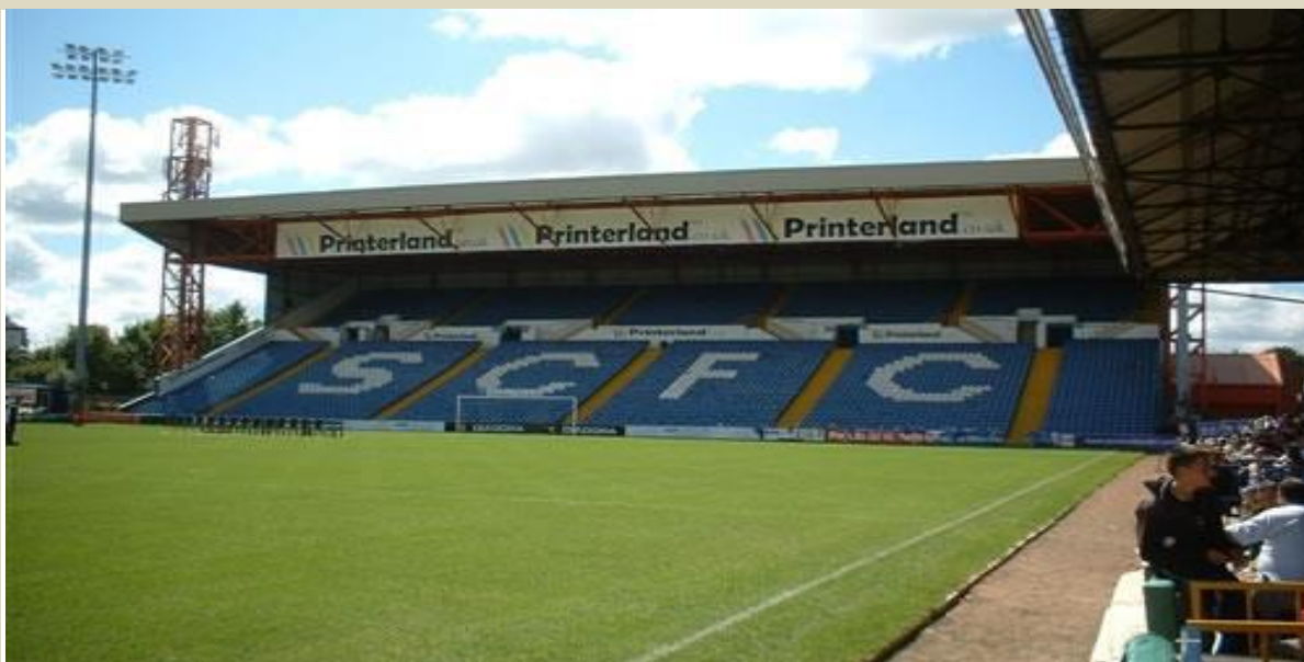
Cheadle Park End

Edgeley Park has 11,000 all seated capacity. The large Cheadle End Stand which towers over the rest of the stadium and was opened at the beginning of the 1995-96 season is two-tiered, covered and all seated and it has a large lower tier, with a smaller upper tier above. Opposite, is the Railway End, a former open terrace which was converted to a seating area in 2001 and above the Railway End is a small electric score board.