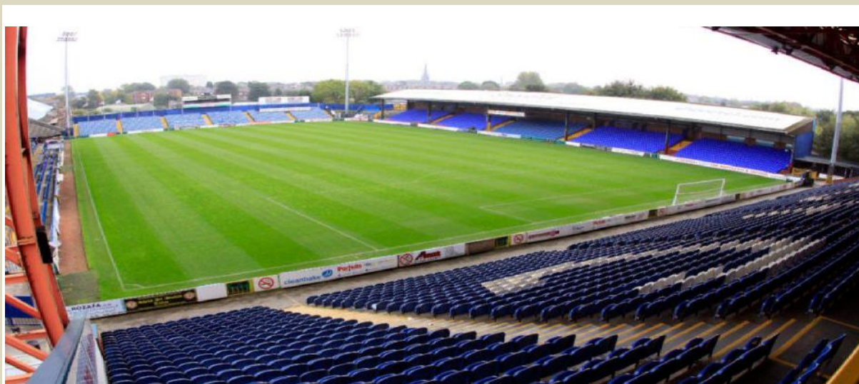
Hardcastle and the Railway End

At the roundabout turn right and continue through to the second set of lights and turn left (ignoring the sign directing you to Stockport Co.) and follow the road to the left, which is Chestergate. At the lights turn right up King Street, past the fire station on the right to the top of the hill, turn right at the roundabout signed Edgeley. Continue down Hardcastle Street turning left after the bus stop signed Caroline Street. At the end of Caroline Street turn right where you will see the main car park on the left. (Not available on Match Days)