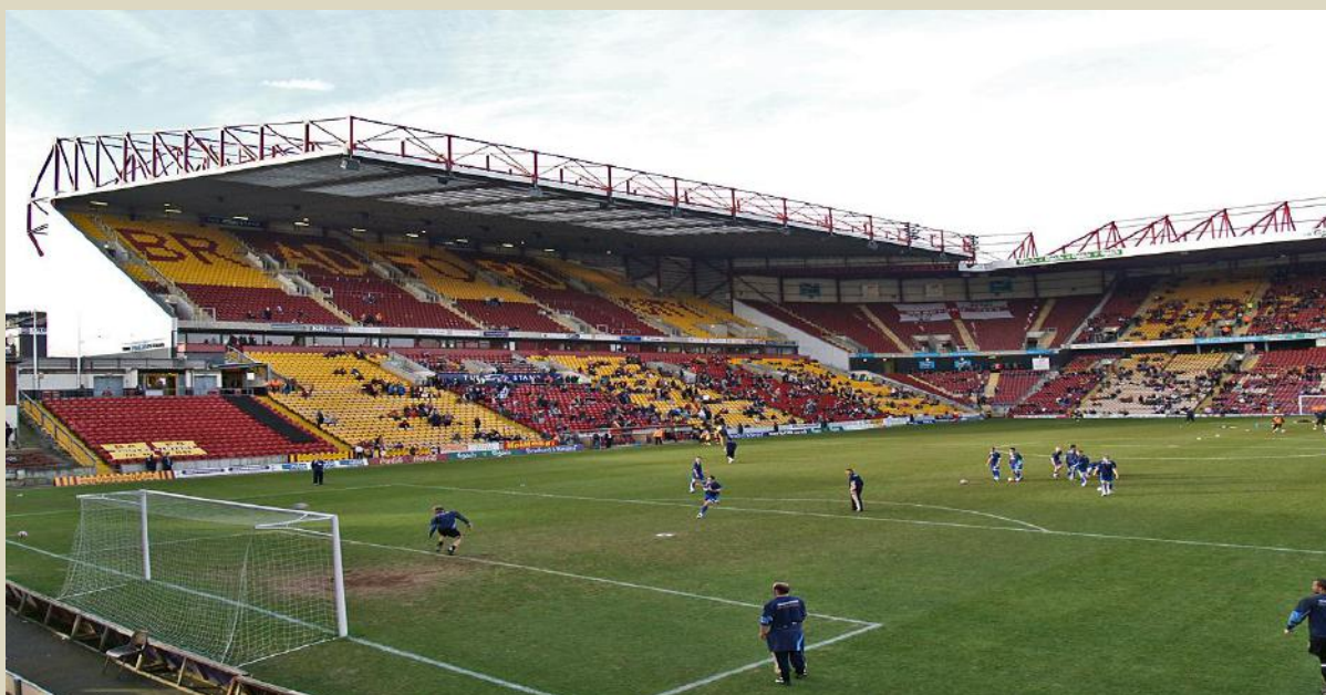
Main and Kop Stands where 56 seats are left empty in memory of the dead of 1985 who did not come home from a football match