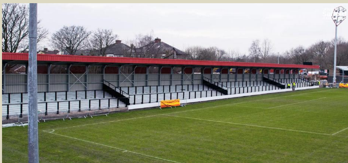
The East Terrace

The Moor Lane football ground is now unrecognisable from what it was like a year ago. The old ground has been completely replaced by four new stands, effectively making it a new stadium.