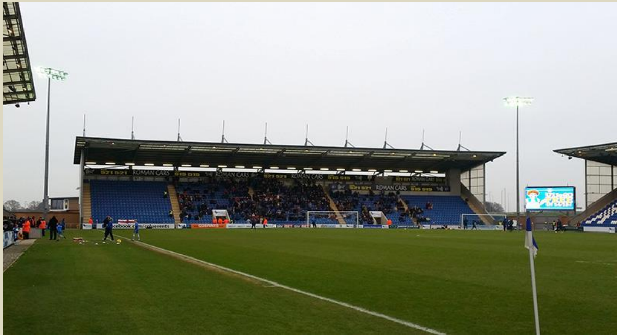
North Stand Tim Dove