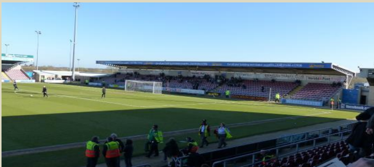
Moulton College Stand

Leave the M1 at Junction 16 and take the first exit at the roundabout and take the A4500 towards Northampton and at the first roundabout take the second exit into Upton Way and at the exit roundabout take the first exit and you will come to the ground on your right.