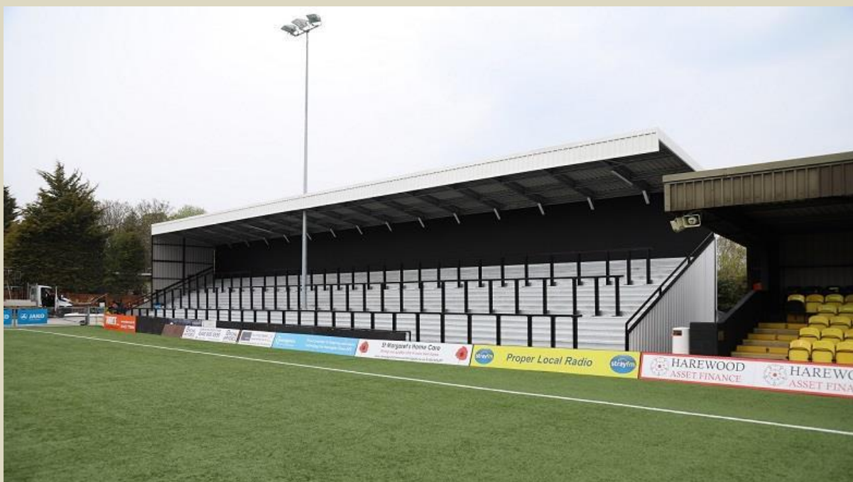
New standing area