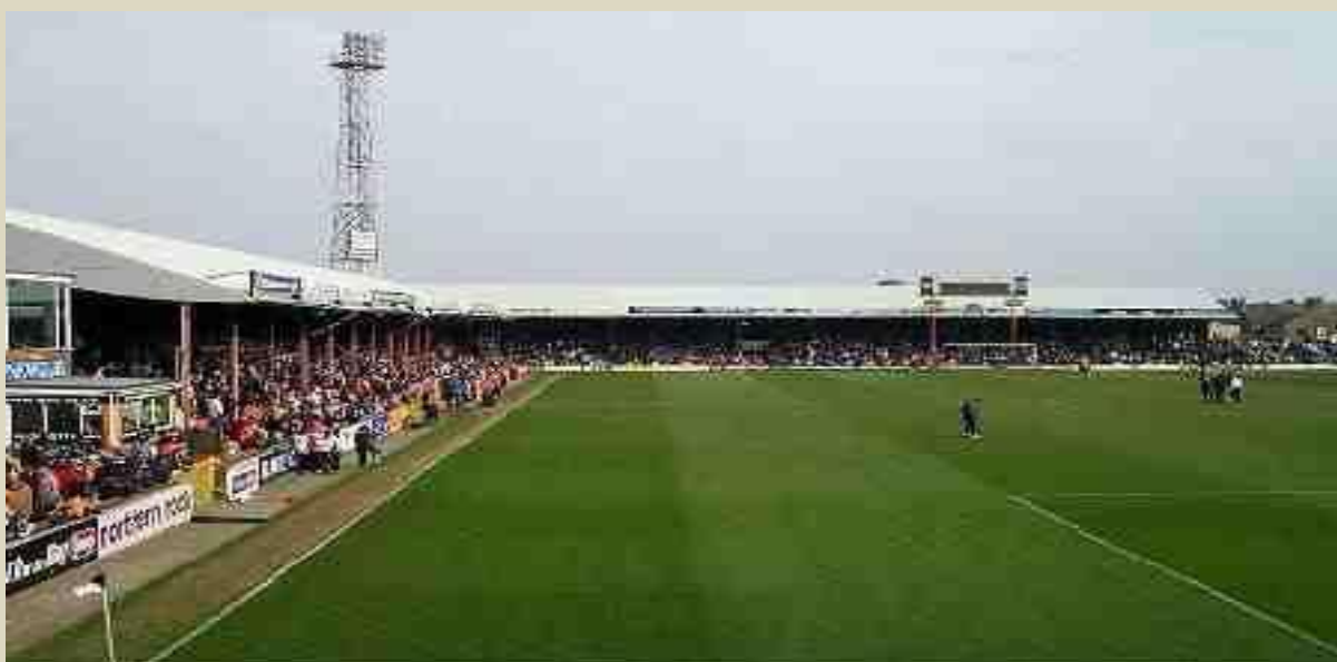
Main Stand & Osmond Street

The Rutland Arms in Rutland Street is also recommended for both home and away fans to mingle and also allows in children, however it is about half a mile before Blundell Park, turn left at Ramsdens superstore and left again, and you'll see the pub at the opposite end of their car park.