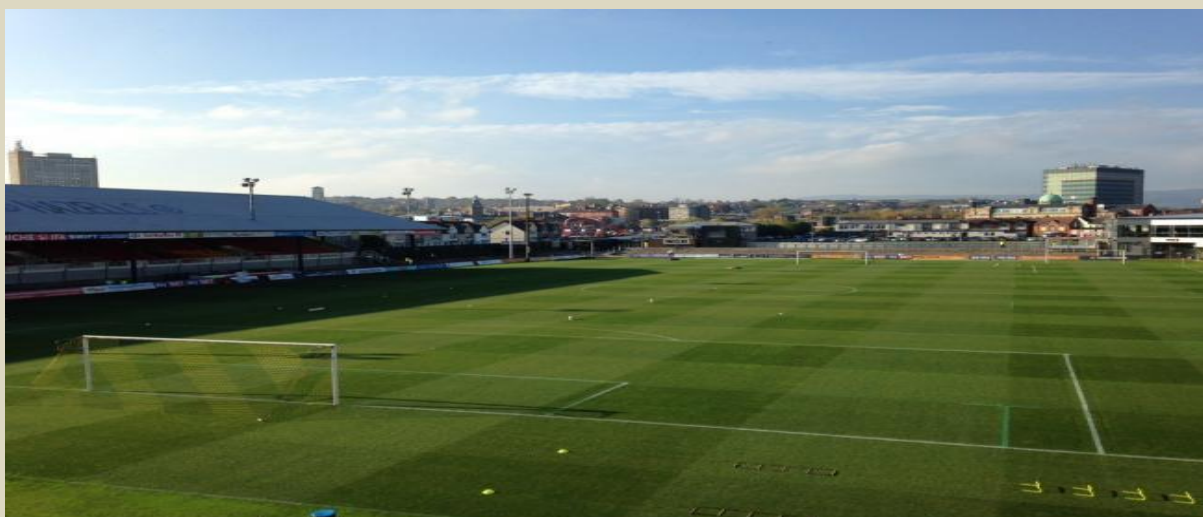
Looking to the town end

The South End is largely unused for spectators for football. In the corner is another building with a large pyramid shaped roof. This houses the dressing rooms and the teams come onto the pitch from this corner of the ground. There is an electric scoreboard mounted on the front of this building.