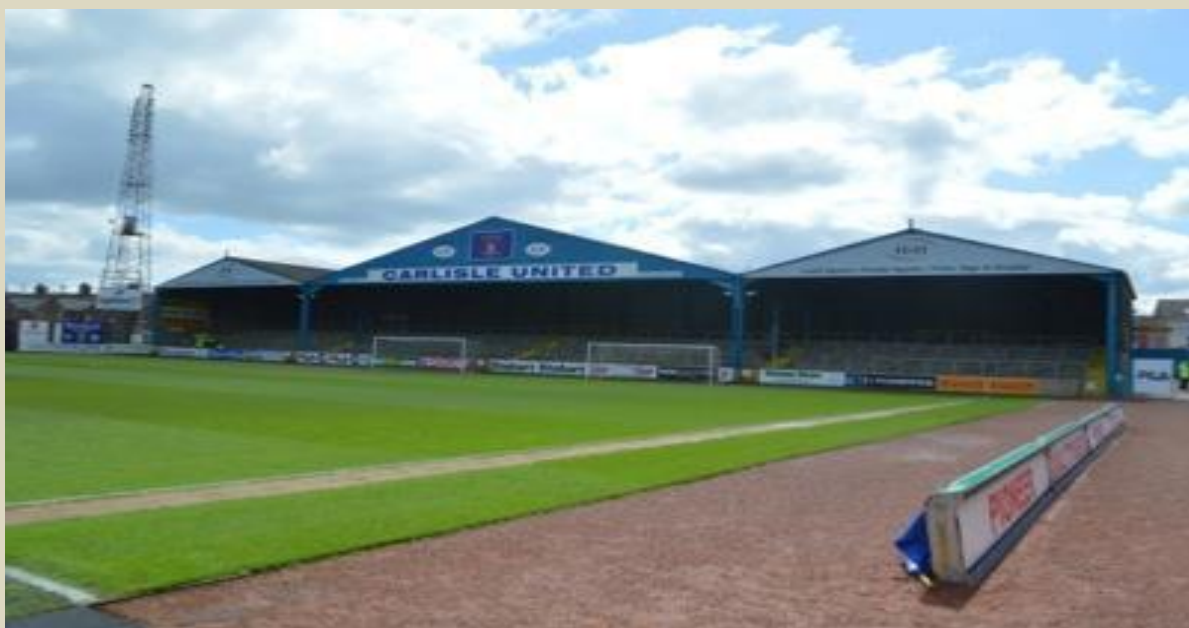
Warwick Road End