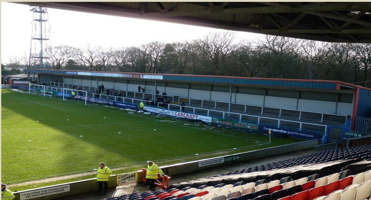
Sandy Lane End (Gibbo 92)

Take Northern Railway train to Bolton Railway Station then walk three minutes to Ash Street and take the 471 First Bus to Bury Interchange then the 468 Rosso Transport to Sandy Lane and its two minutes to the ground