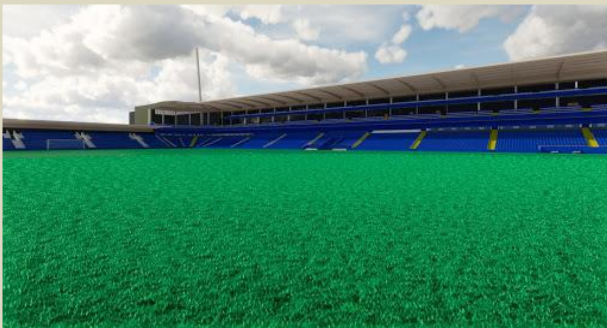
Main Stand and Riverside Road End